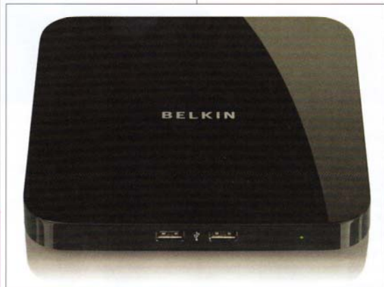
The Network USB adapter from Belkin lets PCs throughout your home share USB devices over your network.

Yes, the Conceal Power Bar from Belkin is just a power bar. But it's the first one that actually seems to have some thought in it. The $50 product includes a hinged cover that lives up to its name, concealing all those unsightly and potentially dangerous electrical