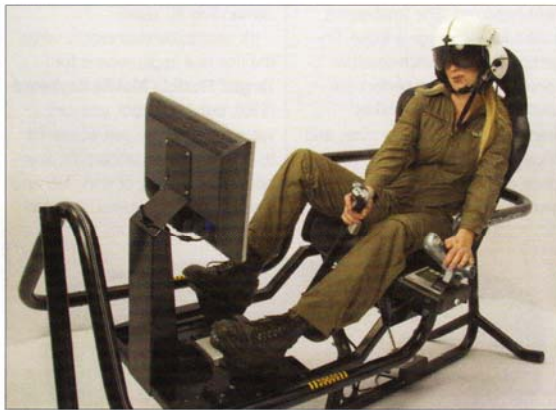
The DreamFlyer Flight Motion Simulator gives you a taste of realistic G-forces when playing Microsoft Flight Simulator.